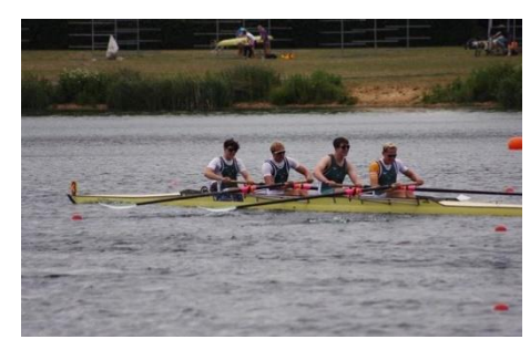
Men's 4+ on their way to 2<sup>nd</sup> place.